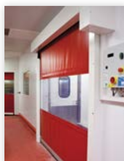
now you see it,

The installation of these doors minimizes the risk of any cross contamination between differing production areas and includes an escape device to ensure the safety of Warren's Bakery employees in the event of power loss or other emergencies in the building.