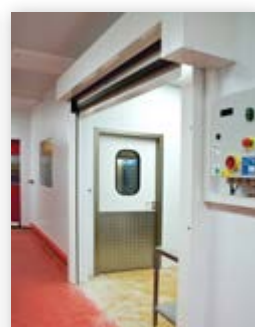
now you don't!