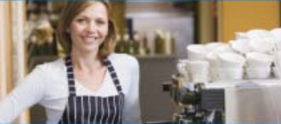
Attractive and save